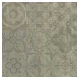
CHARCOAL DECOR 60x60 - 24"x24"