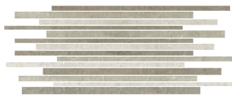
STRIPS 30x60 - 12"x24"