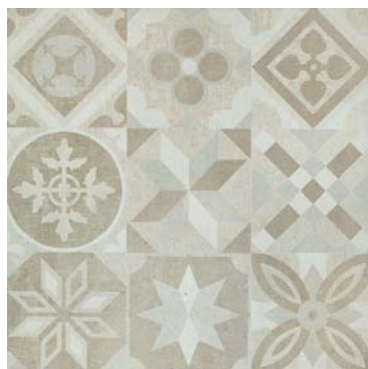
GREY DECOR MATT