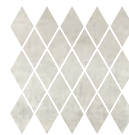
DIAMOND 30x30 - 12"x12"