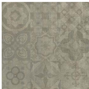
CHARCOAL DECOR MATT