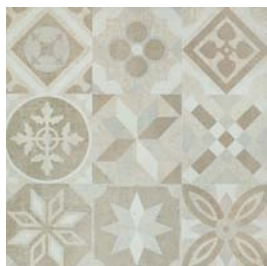
GREY DECOR 60x60 - 24"x24"