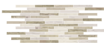
STONE STRIPS 30x60 - 12"x24"