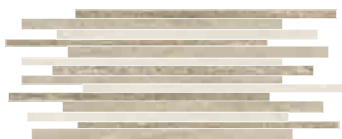
STRIPS 30x60 - 12"x24"