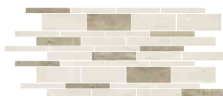
STONE MOSAIC 30x60 - 12"x24"