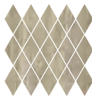
DIAMOND 30x30 - 12"x12"