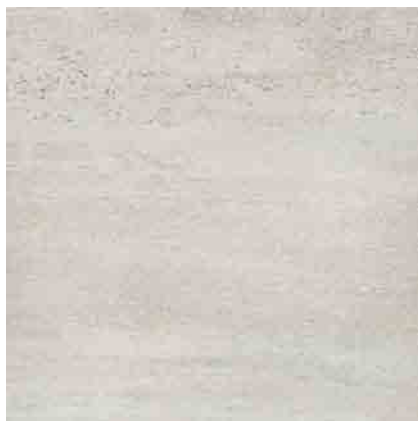
GREY MATT STRUCTURED