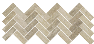
ZIG ZAG 30x60 - 12"x24"