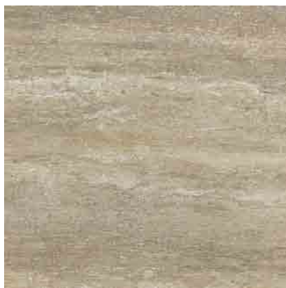
MOCCA MATT STRUCTURED